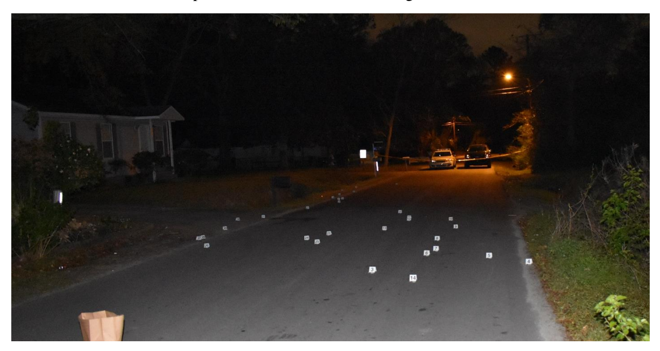
North Charleston Police Department located 37 fired cartridge cases on Orvin Street.

A search warrant led to the recovery of the two firearms used in the shooting. Also located at the house were 166 additional unfired rounds and an extended magazine.